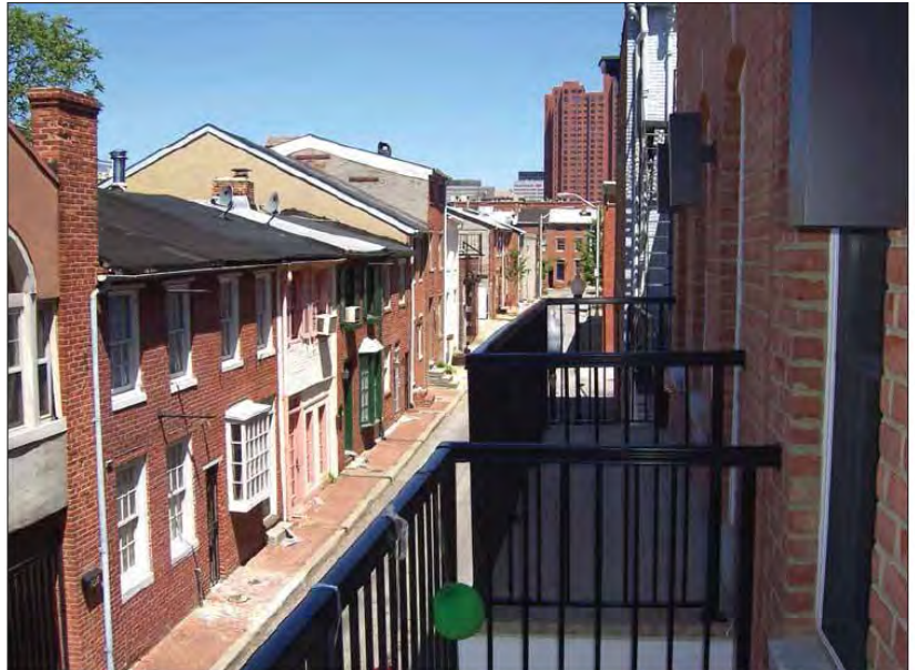
The Homes at Cross, located on Patapsco Street in the historic Federal Hill neighborhood, feature views of downtown Baltimore

The Homes at Cross sell for $749,000 each and feature 2,400 square feet over three levels. With all-brick fronts and Marvin wood windows with true-divided lights, each home features "huge front-to-back roof decks with unobstructed views of downtown and Ravens Stadium. The roofs are built with truss systems to hold up to 48,000 pounds. So go ahead and squeeze 'em up there on the Fourth of July and New Year's Eve," Rieth said.