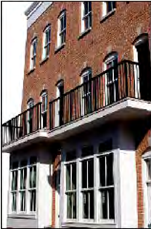
Quite a coop - Once a home for chickens, The Homes at Cross offer convenient opulence.